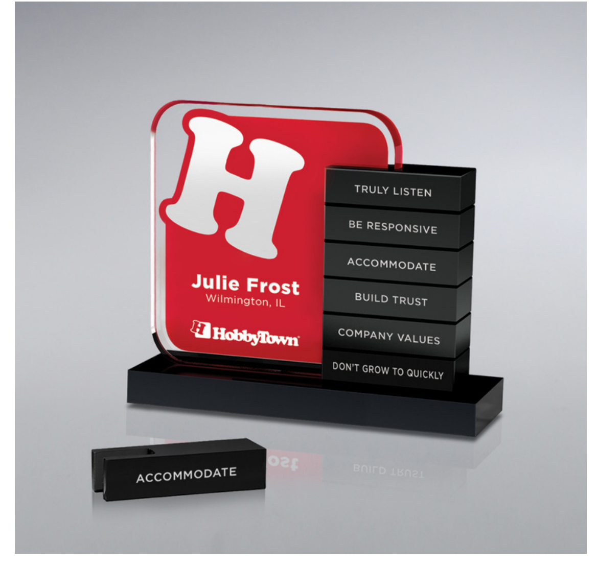
CD983 CLEAR ACRYLIC ADD A BAR PERPETUAL(ACRYLIC BARS SOLD SEPARATELY) 8" X 6 1/2" X 2 1/4"