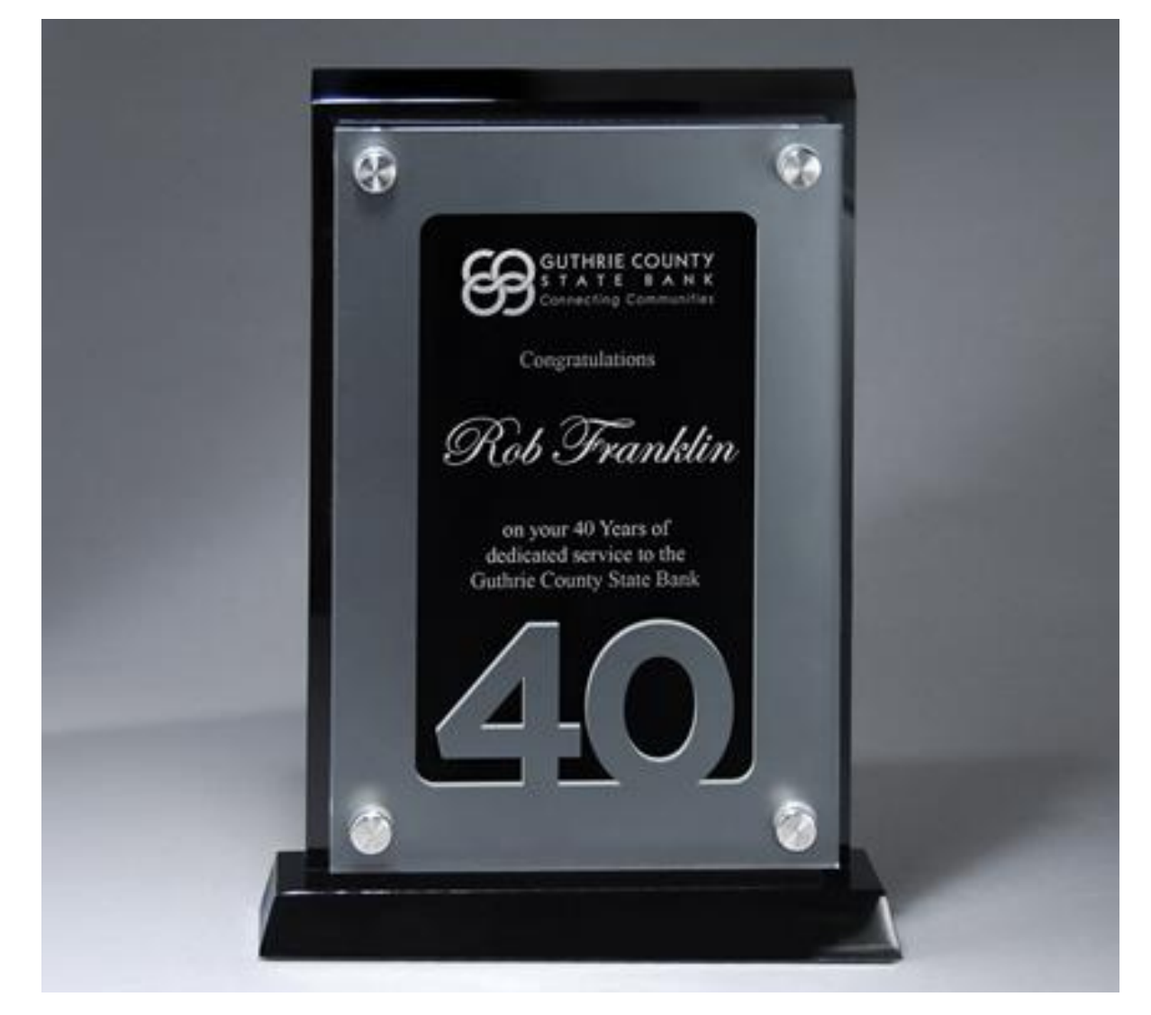
CD901Y* ANNIVERSARY ACHIEVEMENT AWARD, BLACK 7 1/2" X 10 1/4" X 2"