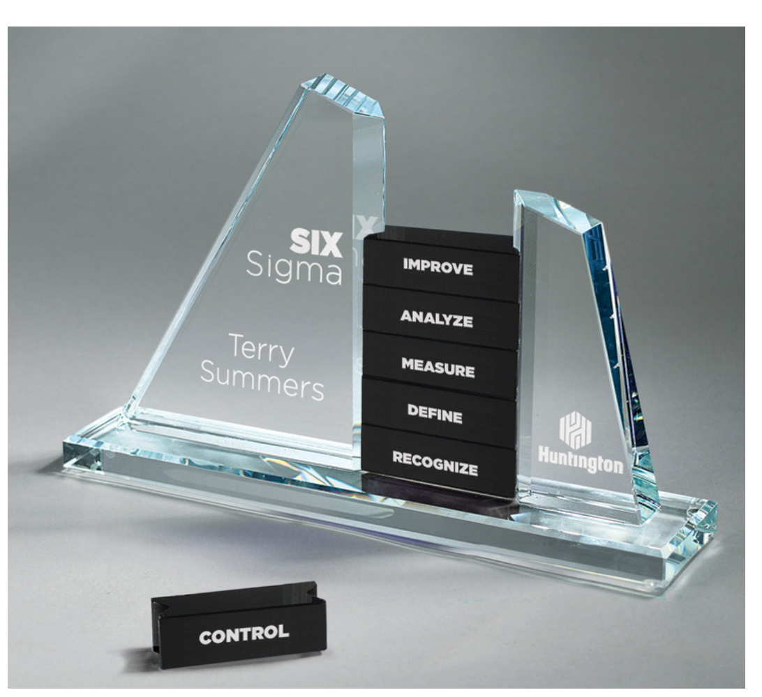
CD1076 & CD1075C STACKABLE CLEAR ACRYLIC 3" X 3" X 1 1/2"